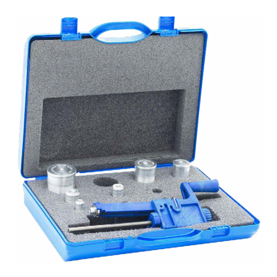
FIG. 1 Calderprep™ Plus Tool Kit